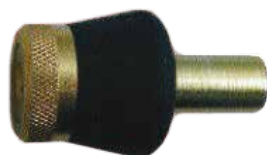
Model No. 41102 Screw chuck replaces the chuck on your power drill (3/8" - 24 thread).