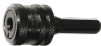
Model No. 40011 Standard industrial chuck with knurled sleeve.