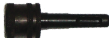
Model No. 41103 SDS+ chuck allows for use with your SDS+ machine.